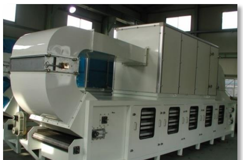
NOUGAT, CAMEL & CEREAL BAR EQUIPMENT ....