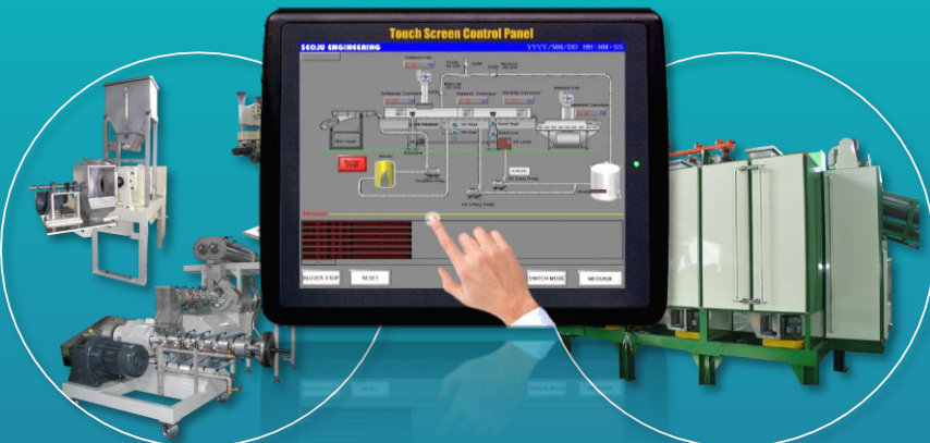
Extruder & Kneader