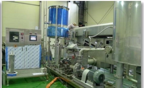
POTATO CHIP & SNACK EQUIPMENT .....