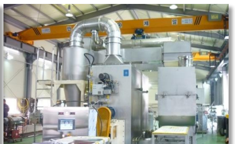
EXTRUDER, DRYER, FLUID BED EQUIPMENT .....