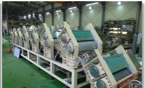
INSTANT NOODLE EQUIPMENT .....