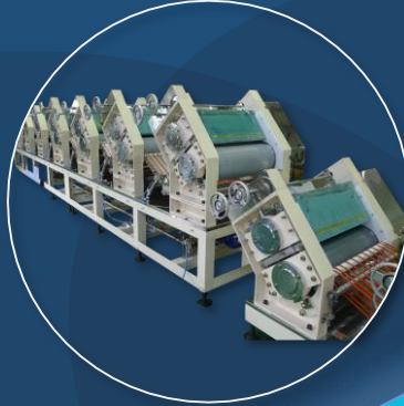
Instant Noodle System