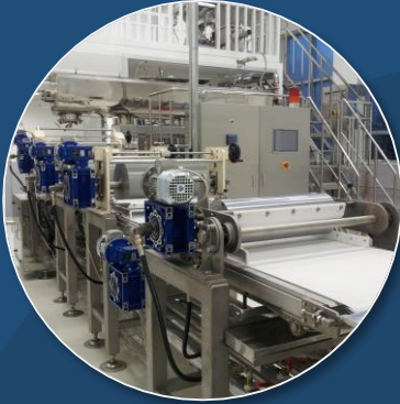
Cereal Bar System