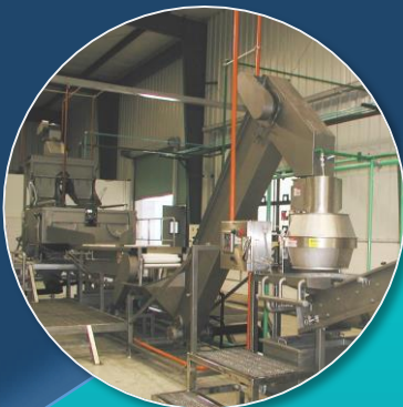
Potato Chip System